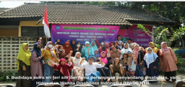
5. Budidaya sutra eri (eri silk) bersama perempuan penyandang disabilitas, yaitu Himpunan Wanita Disabilitas Indonesia (HWDI) NTB.