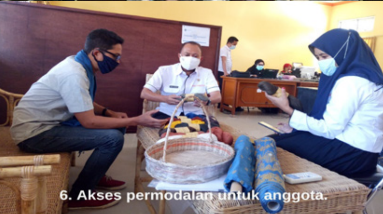
6. Akses permodalan untuk anggota.